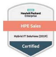
HPE Sales Certified Hybrid IT Solutions