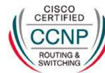
CCNP Routing and Switching