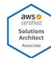
AWS Solution Architect Associate