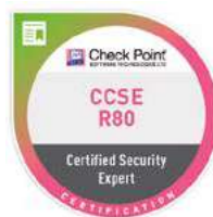
CheckPoint CCSE R80

Our multidisciplinary team of professionals continues to transform itself in order to offer the best service to clients. Proof of this is its combined qualifications, of which we highlight the following: