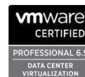
VMware Certified Professional – Datacenter Virtualization